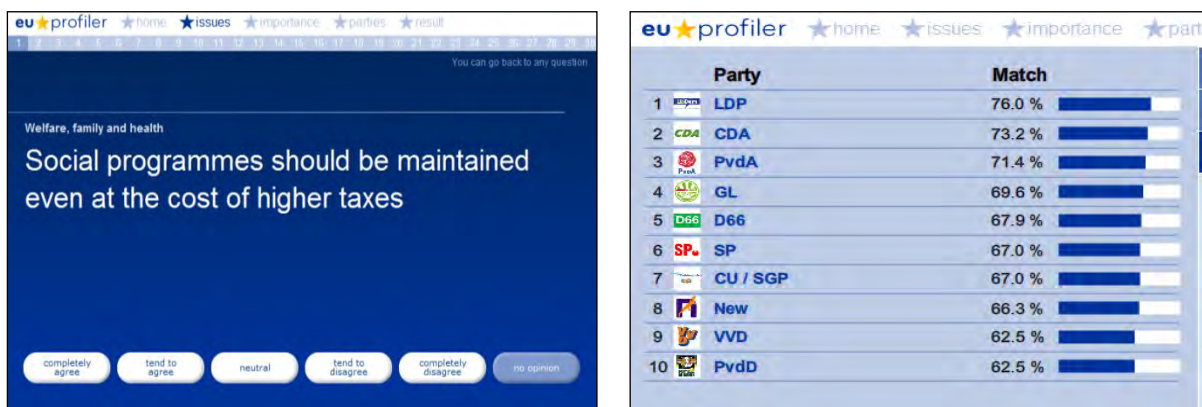
Figure 1. Example of a VAA statement (left); the ‘voting advice’ provided in the results screen (right)

issues (for a review, see Garzia and Marschall 2014). The core of every VAA that enables this comparison is a list of political issue statements formulated by the body that created the VAA, e.g., “social programmes should be maintained even at the cost of higher taxes”. Each user can express her degree of agreement or disagreement with each particular statement (see Figure 1, left). The resulting issue preferences of the user are then matched with the positions of the parties on these same issues. After comparing the user’s profile with that of each party, the application produces a “voting advice”, usually in the form of a rank-ordered list, at the top of which stands the party closest to the user’s policy preferences (see Figure 1, right).